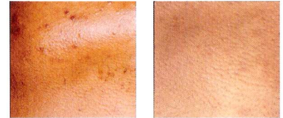
Pseudofolliculitis Barbae (PFB)